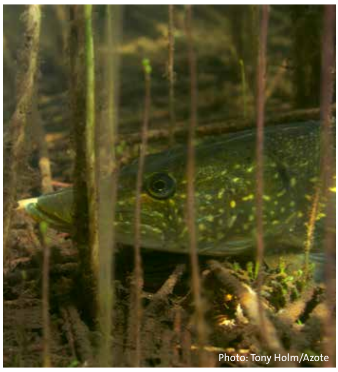
Healthy stocks of predatory fish like pike in coastal areas can mitigate eutrophication effects.