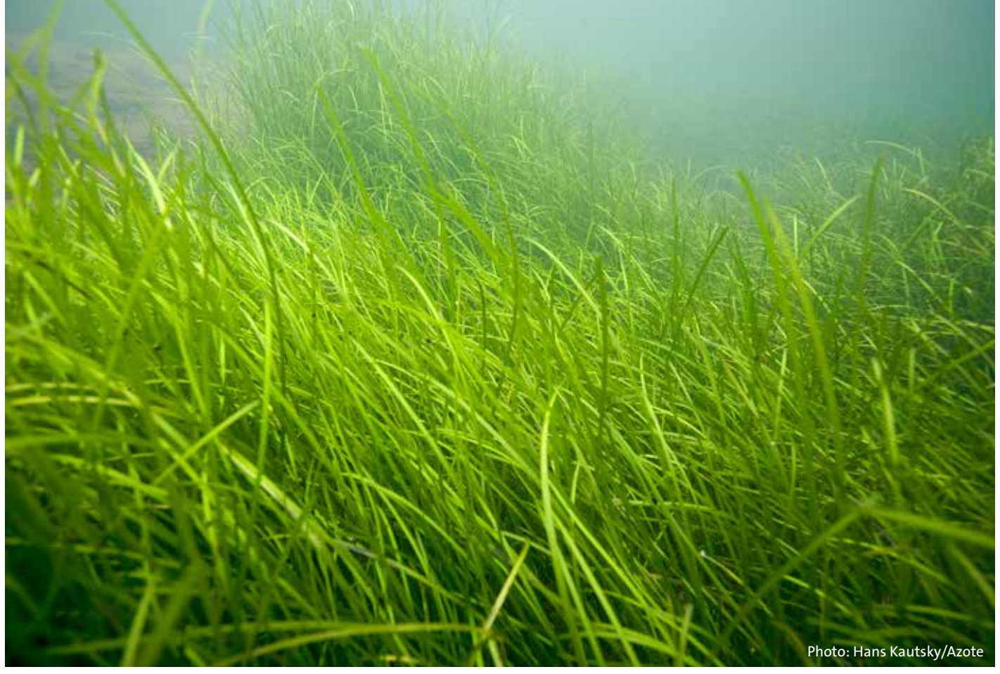
Meadows of seagrass provide important benefits not only for coastal communities but for the region at large.

Nature Directives, Marine Directive, the Biodiversity Strategy and UN Sustainable Development Goals are automatically fulfilled. Nor does it guarantee the actual objective of marine protection: preserved biodiversity and continued sustainable exploitation of marine resources.