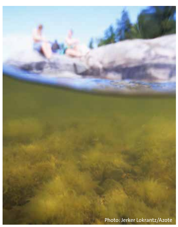
The sea's most critical habitats are often located where we humans like to swim, fish and moor our boats.

Protecting 10 percent of the marine environment does not mean that the qualitative requirements and goals set in the