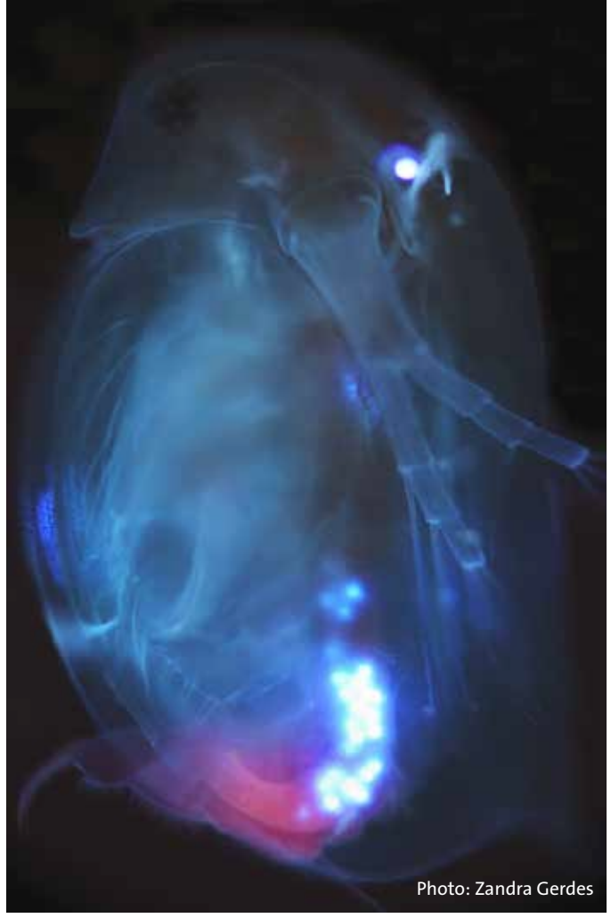
The zooplankton Daphnia with ingested microplastics.

Allow the precautionary principle to be paramount in achieving Good Environmental Status in accordance with the Marine Directive. Because plastics and highly persistent chemicals take a very long time to degrade, the problem is largely irreversible once it has been detected.