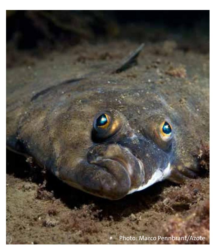
Microplastics have been found in the stomach of one in ten flounder caught in the Baltic Sea.

But there is reason to believe that higher concentrations of microplastics would be found in the marine environment should the particles collected be smaller than those commonly collected today. For example, a study using a filter for catching particles as small as 0.01 millimetres found concentrations of microplastics to be a thousand to a hundred thousand times higher than the concentrations measured using a filter for catching particles no smaller than 0.3 millimetres in size.